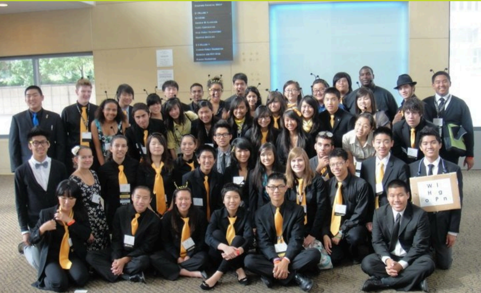
Front Cover: The California Nevada Hawaii International Convention Group in Memphis, Tennessee representin' CNH with style!

Please BEE green. Do not print this newsletter.