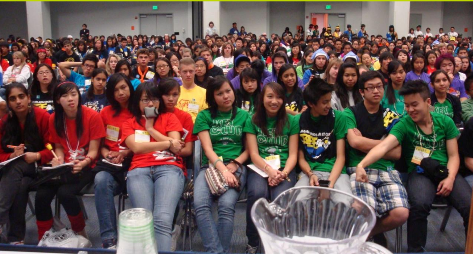
pictured: CNH Presidents and Vice Presidents Workshop at District Convention 2009 in Anaheim, CA

Please BEE green. Do not print this publication. Thank you!