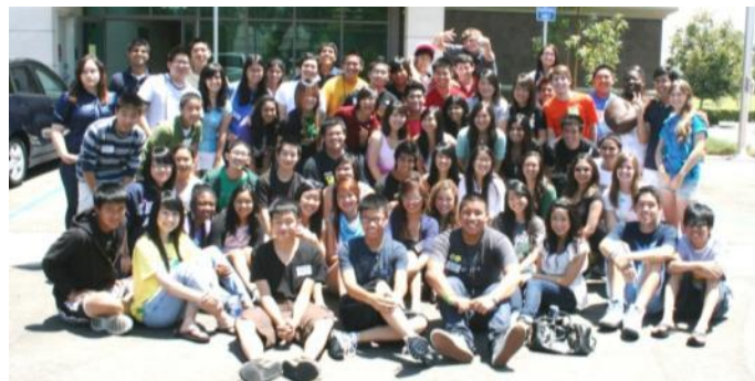
The 2009-10 CNH Board of Trustees

Club: Each club is led by the Board of Directors. The Board of Directors consists of the club president, vice president(s), secretary, treasurer, bulletin editor, and a class representative from each class. The first five listed officers should be elected before District Convention. Another election should be held at the beginning of the school year to elect one representative from each class (freshman, sophomore, junior, senior). We have more than 640 clubs in the CNH District.