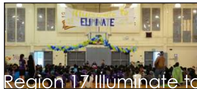
Region 17 Illuminate to