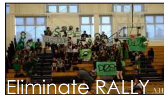
Eliminate RALLY AM